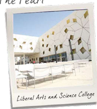
Liberal Arts and Science College